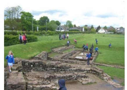
The remains of Roman barracks where real armies slept.

This term we have also been learning about Italy. Did you know that Italy sticks into The Mediterranean Sea like a boot? It is famous for the Leaning Tower of Pisa and of course it's pasta and pizza. We also learnt about the Mona Lisa which was painted by Leonardo Da Vinci .