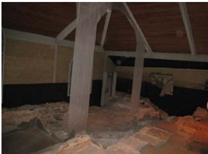
The Roman baths; where Romans used to go to get clean, socialise and relax.