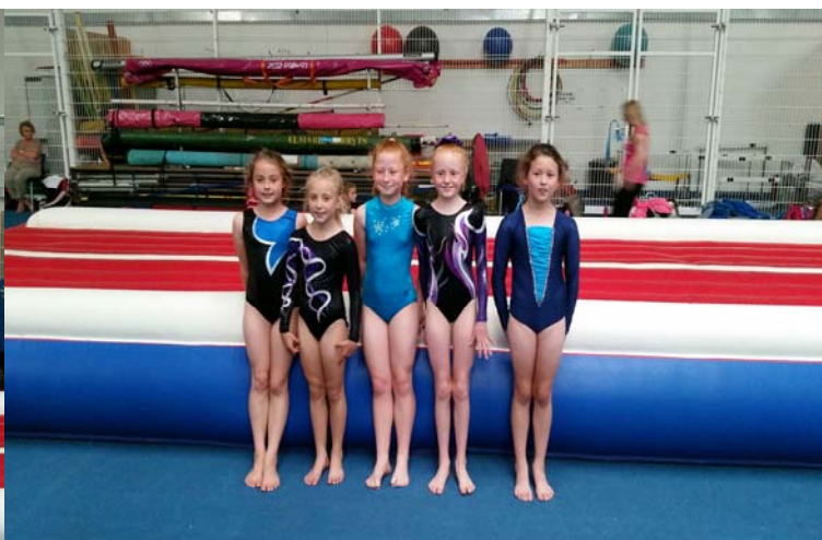
Level 1 and Level 2 Gymnastics teams at Sainsburys schools games at Bath University.