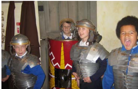
Experiencing the life of a Legionary soldier in the Barrack Room dressed as Roman soldiers.